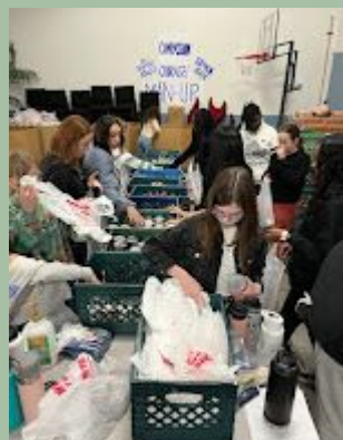
St. Matthews Food Bank Trip