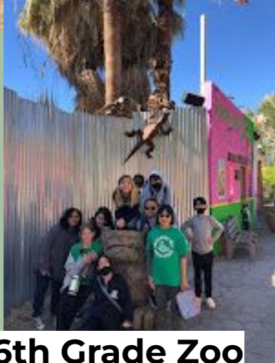
6th Grade Zoo Field Trip