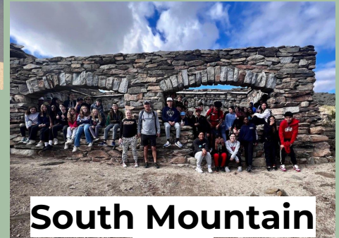
South Mountain Hike