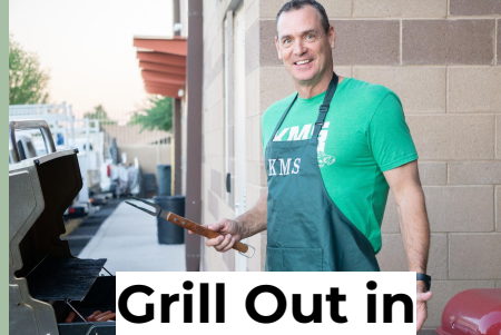
Grill Out in Guad